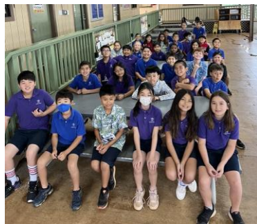
Hanalani 4 th Graders